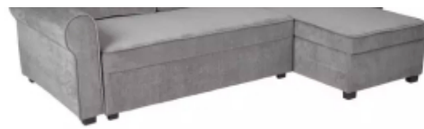
Argos Home Addie Reversible Corner Fabric Sofa - Grey