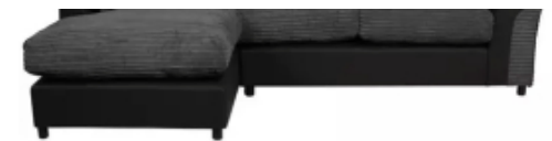
Argos Home Harry Large Left Corner Fabric Sofa - Charcoal