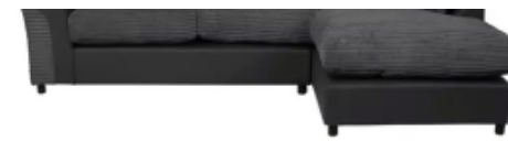
Argos Home Harry Large Right Corner Fabric Sofa - Charcoal